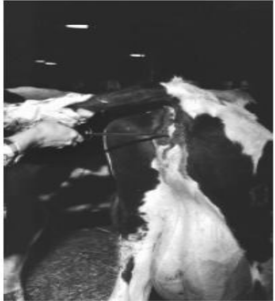
Vaginal electrical resistance probe.