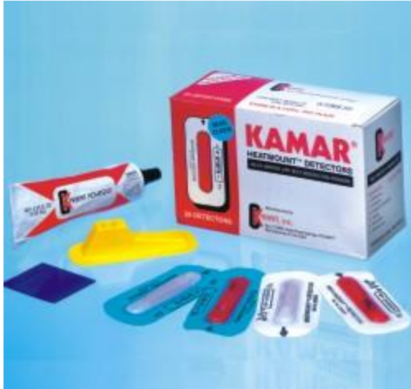
Different Types of KAMARs in Production