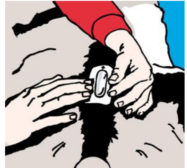
Proper Application of a KAMAR