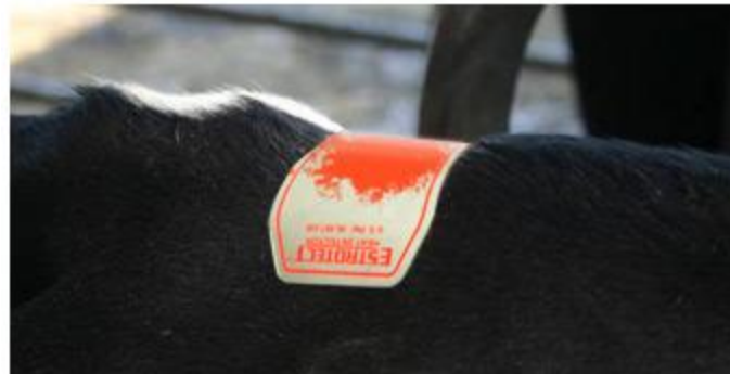
This Patch Shows the Cow in Heat